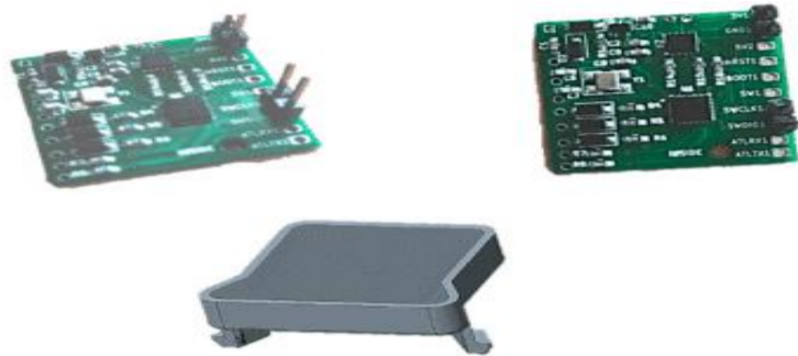
Fig: CAN Converter